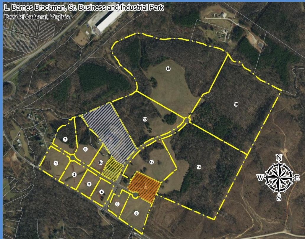
L. Barnes Brockman, Sr. Business and Industrial Park Town of Amherst, Virginia

Companies looking to expand or relocate into the Town of Amherst will find a welcoming environment that only a small town can offer! Take advantage of our low tax and utility rates, growing population, and easy access to large markets across Virginia and the United States.